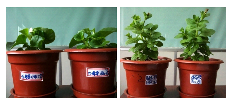
Fig. 1. Begonia and Petunia used in pot experiment

Three types of fertilizers, viz. composite organic fertilizer (COF), composite inorganic fertilizer (CIF) and foliar spray of multinutrient solution (FSMN) were used in this study. Composite organic fertilizer (COF) is a new liquid fertilizer of East China University of Science and Technology, Institute of Chemical Technology. It is derived from cotton stalks obtained by a new technology of cotton stalk pulping with potassium hydroxide and ammonia liquor. The resulting liquid can be directly used as organic fertilizers after addition