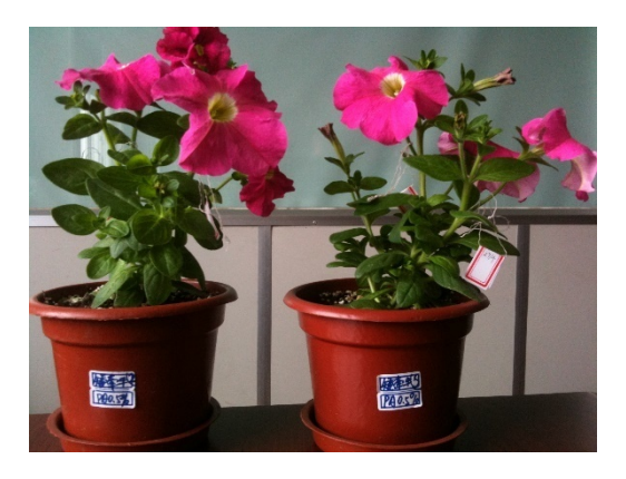
Fig. 3. Begonia and Petunia flowers 40days after planting (in COF treatment)

flowers/plants in experiments of Begonia and Petunia. Its effectiveness is equivalent to the effectiveness of "The common nutrient solution in garden of Japanese" in Begonia experiment (Zhou et al., 2013) and better than the nutritional formula of Klock-Moore and Broschat (2001) in Petunia experiment.